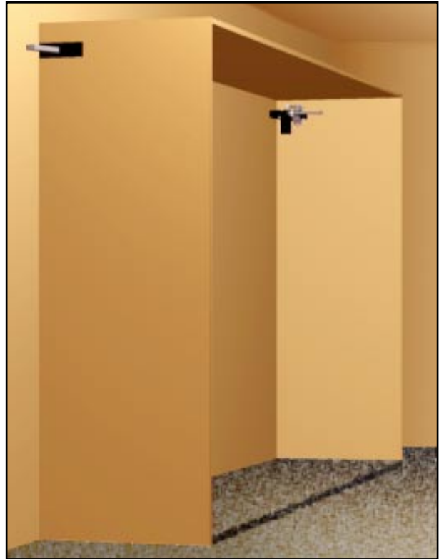
The Travel Clamps are located inside the room, at both top corners.