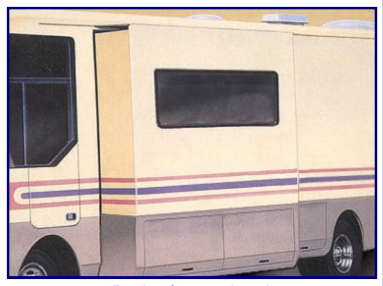
Exterior of room and coach.