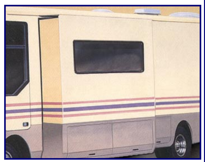
Exterior of room and coach.