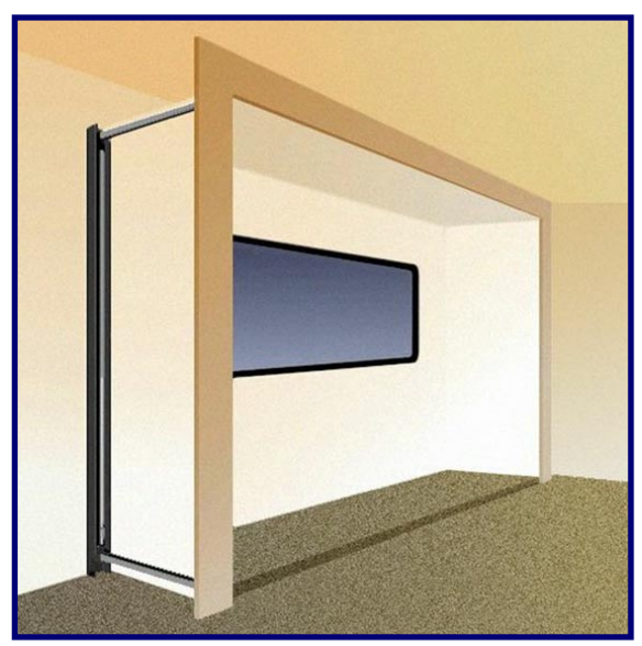
Interior view of room.