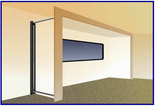
Interior view of room retracted.