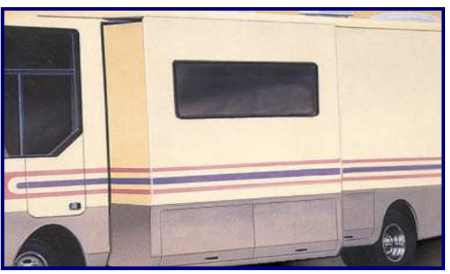
Exterior of room and coach.