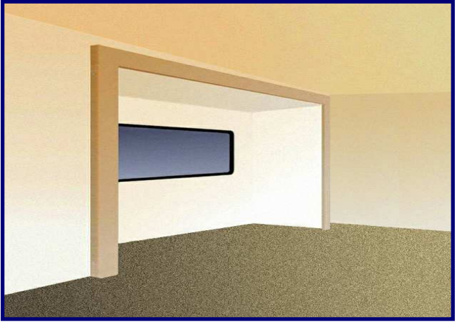
Interior view of room extended.