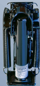
HWH® Kick-Down Power-Extend/Spring-Retract Jack

Choose the control panel option that best suits your leveling needs. Joystick, Touch Panel or Computerized.