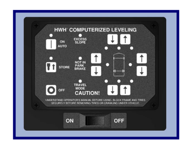
Touch Panel Easy-to-use controller for true automatic operation

Control Valves are directly mounted to jack. (No hose connection)