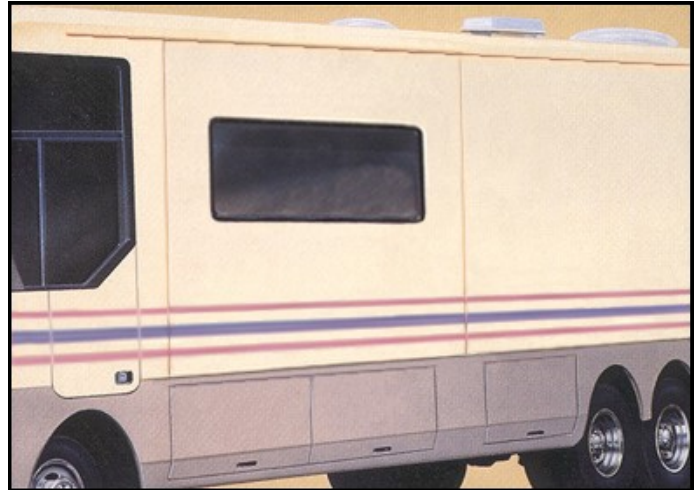
Exterior of room and coach.