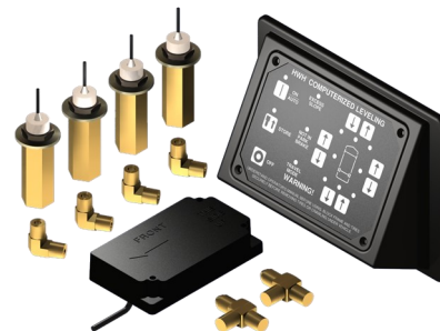
AP47562 Control Kit

725 Series, 12 Volt DC Motor and Pump 125 amp - 3,000 psi relief with prewired control module and jack valving