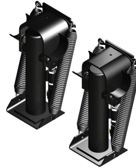
AP0229 Jack Kit

Two Kick-Down (Power-Extend/Spring-Retract) Jacks with a lifting capacity of 6,000 lbs. per jack Standard Profile