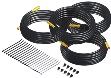
AP0253 Hose Kit

725 Series, Single-Step Computer-Controlled Hydraulic Leveling System with BI-AXIS ® Touch Panel & Leveze ® Light Package