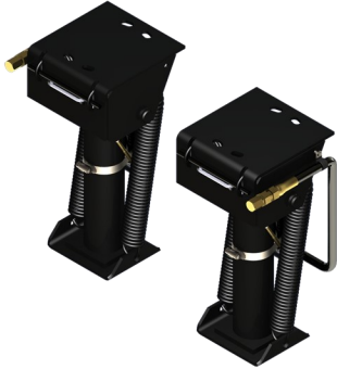
AP0228 Jack Kit

Workhorse/Chevy to 2001 - (Brackets Ordered Separately)