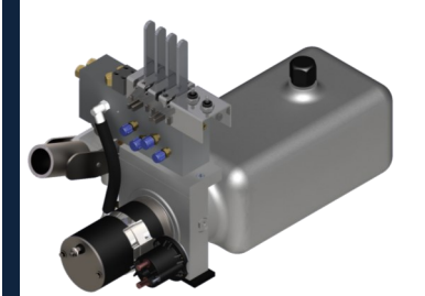
AP42768 Power Unit Hand/Electric Pump with Hydraulic Switches

Two Straight-Acting, (Power-Extend/Spring-Retract) Jacks with a lifting capacity of 9,000 lbs. per jack and a 13" stroke