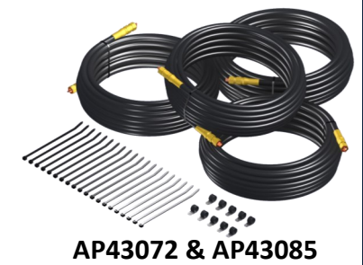
AP43072 & AP43085 Hose Kit

The Leveleze® Indicator makes leveling easy. Avoid the confusion of looking at a level bubble to figure which side or end of the trailer needs to be leveled.